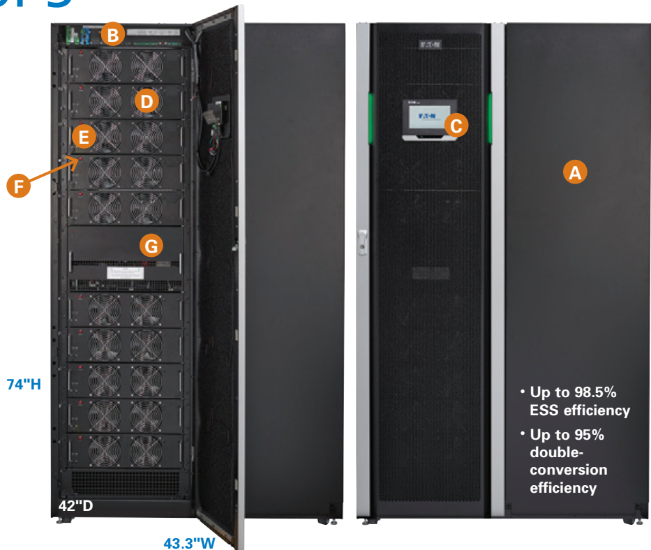
Open front view of the unit